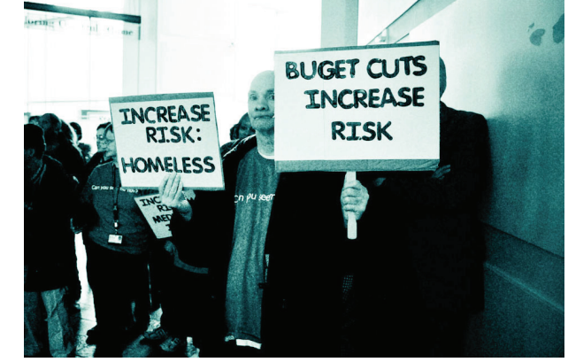
Clients from the KETCH Encore program hold signs signifying the risk budget cuts may put them in.

For more information on advocacy contact Ashley Ruckman, 316.383.8889 or aruckman@ketch.org.