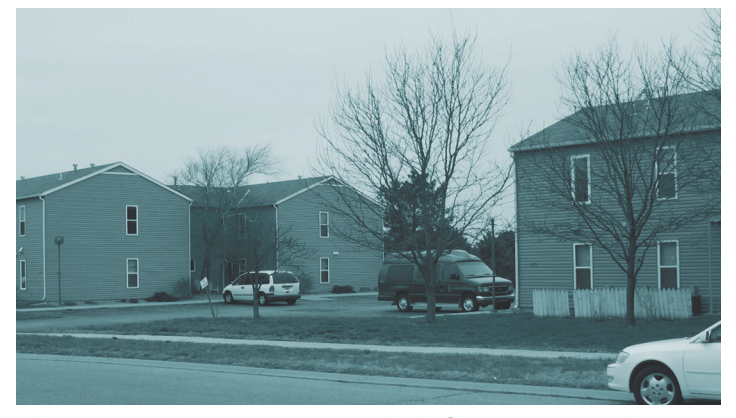
The Country Acres apartment complex before construction began earlier this year.

In these new settings the utility efficiency will be