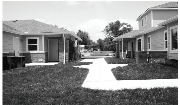
Richmond Place after its completion.