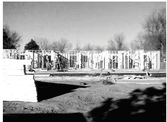
The 10th Street Project is making great progress. This housing development is focused on individuals with behavioral challenges.